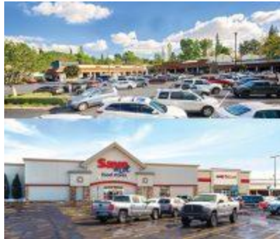
Faris Lee Brokers Sales of Two Retail Assets in Southern California, Colorado Springs Totaling $26.1 Million February 4, 2020