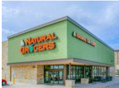
Marcus & Millichap Arranges $6.8 Million Sale of Natural Grocers-Occupied Retail Asset in Denver April 29, 2020