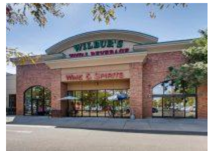
CIM Group Sells University Center Retail Property in Fort Collins for $23.7 Million October 10, 2019