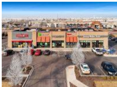
CBRE Brokers $4.1 Million Sale of E Shops at Mesa Ridge in Fountain, Colorado November 22, 2019