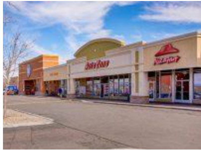
Dunton Commercial Acquires Belmont Square Retail Center in Colorado for $6 Million January 8, 2021