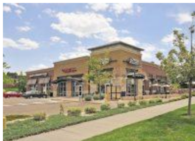
Marcus & Millichap Brokers $9.2 Million Purchase of Country Club Village Retail Property in Metro Denver October 29, 2019