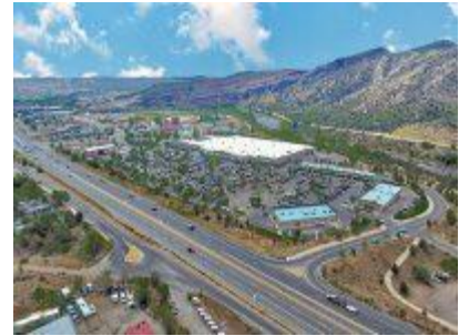
Marcus & Millichap Brokers $13.3 Million Sale of Durango Town Center in Colorado July 7, 2020