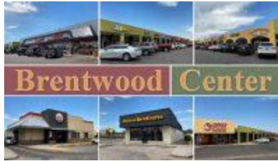
Pinnacle Estate Advisors Negotiates $14.9 Million Sale of Brentwood Center Retail Property in Denver January 4, 2021