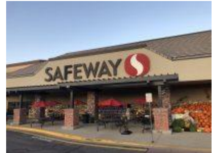
Boulder Group Negotiates $14.7 Million Sale of Net-Leased Safeway in Metro Denver January 6, 2020