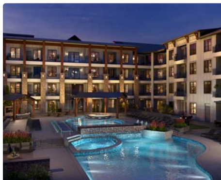
Cortland Begins Construction of