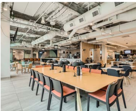
A Contrarian Approach to Office